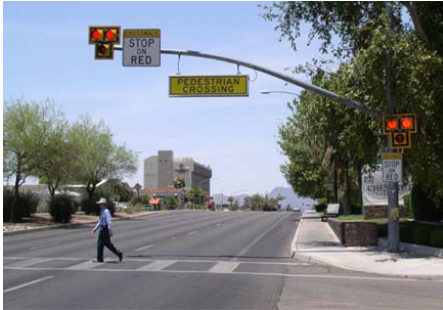
HAWK Beacon Assembly (Ashby Approaches)