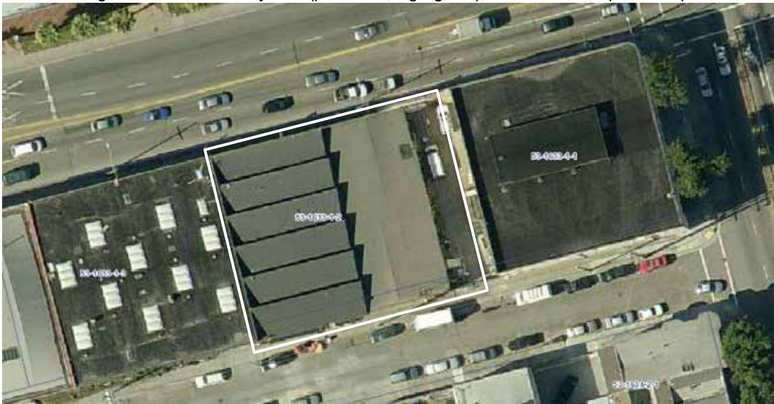
Fig.7 – 1042-1046 Ashby Ave. (bounding box), from assessor's parcel info