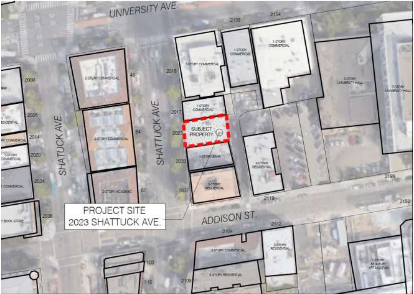
Figure 2: Downtown Area Plan Land Use Map Detail