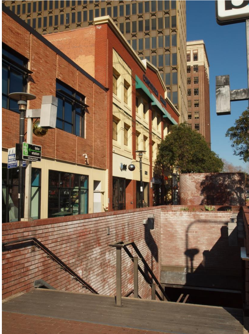
View of façade from entry to BART, viewed facing northwest.

In 2005, JRP Historical Consulting reevaluated the property for the East Bay Bus Rapid Transit Project. They believed the building was altered significantly to no longer be eligible for the National or California Registers. The building was given a status code by OHP of 6Y - Determined ineligible for NR, not evaluated for CR or local listing.