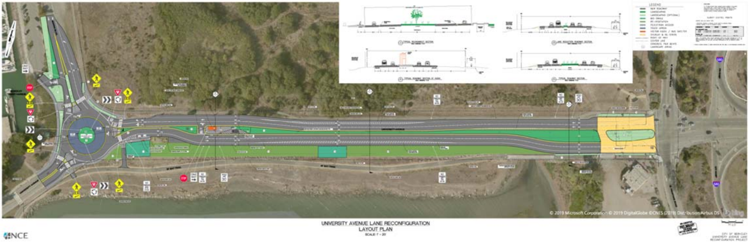
Schematic Layout of University Avenue Lane Reconfiguration Project