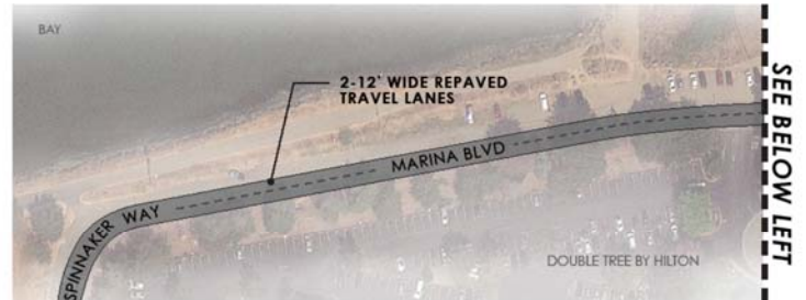
Plan - Area A