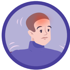
Fever or Chills