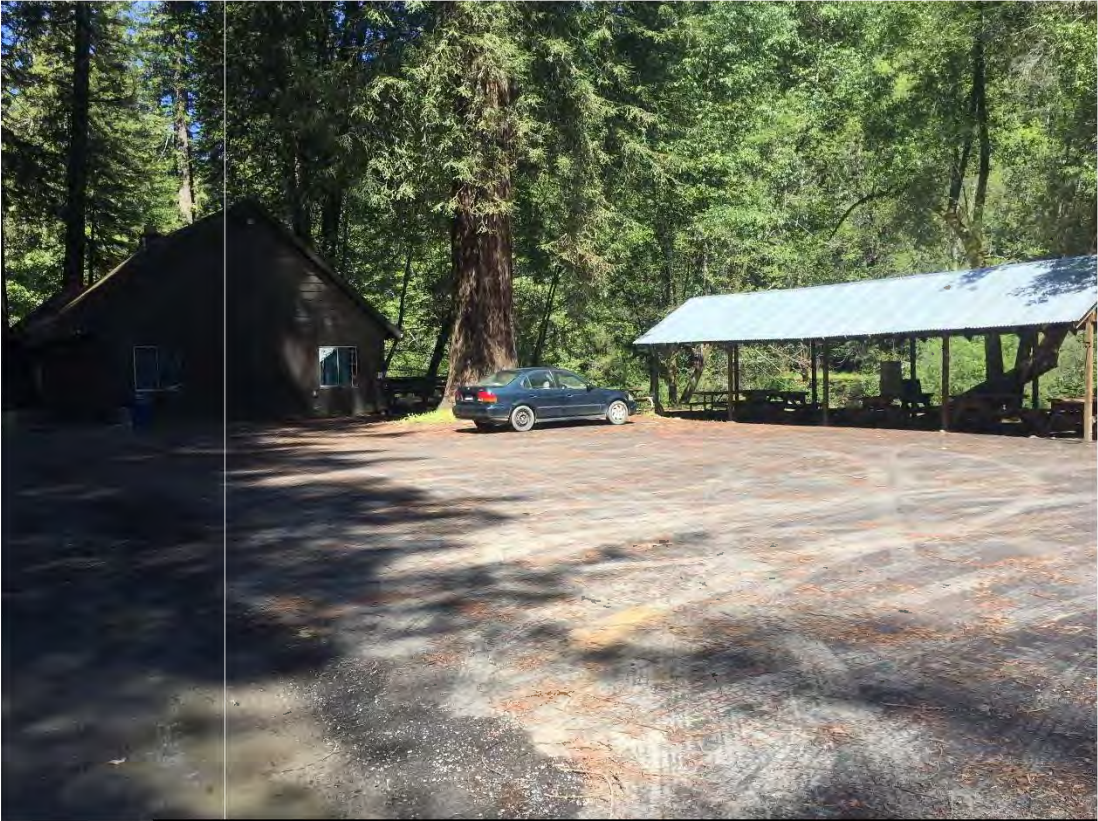
Before March 2019 flood event.