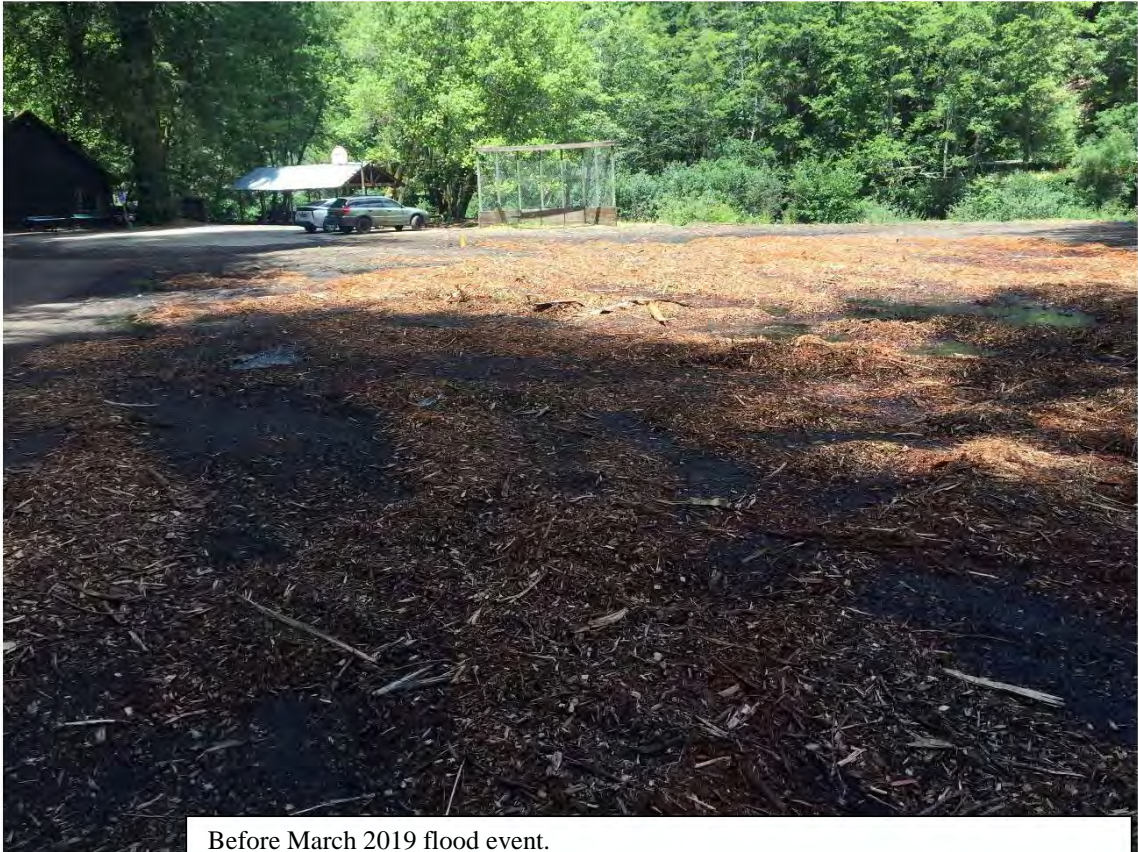
Before March 2019 flood event.