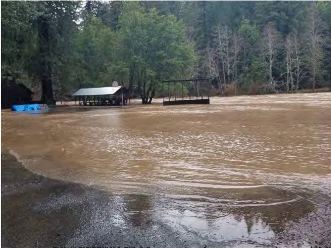
After March 2019 flood event.