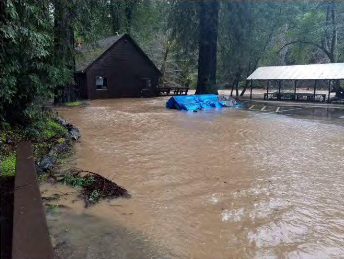
After March 2019 flood event.