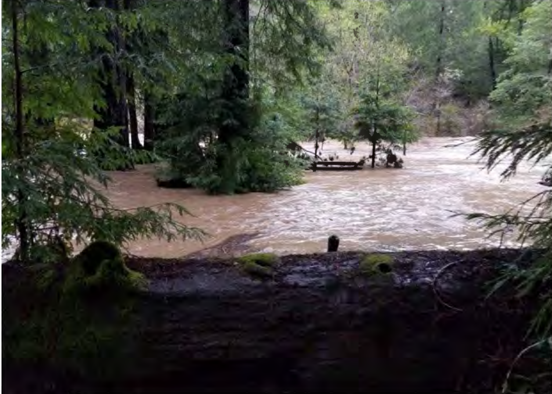
After March 2019 flood event.