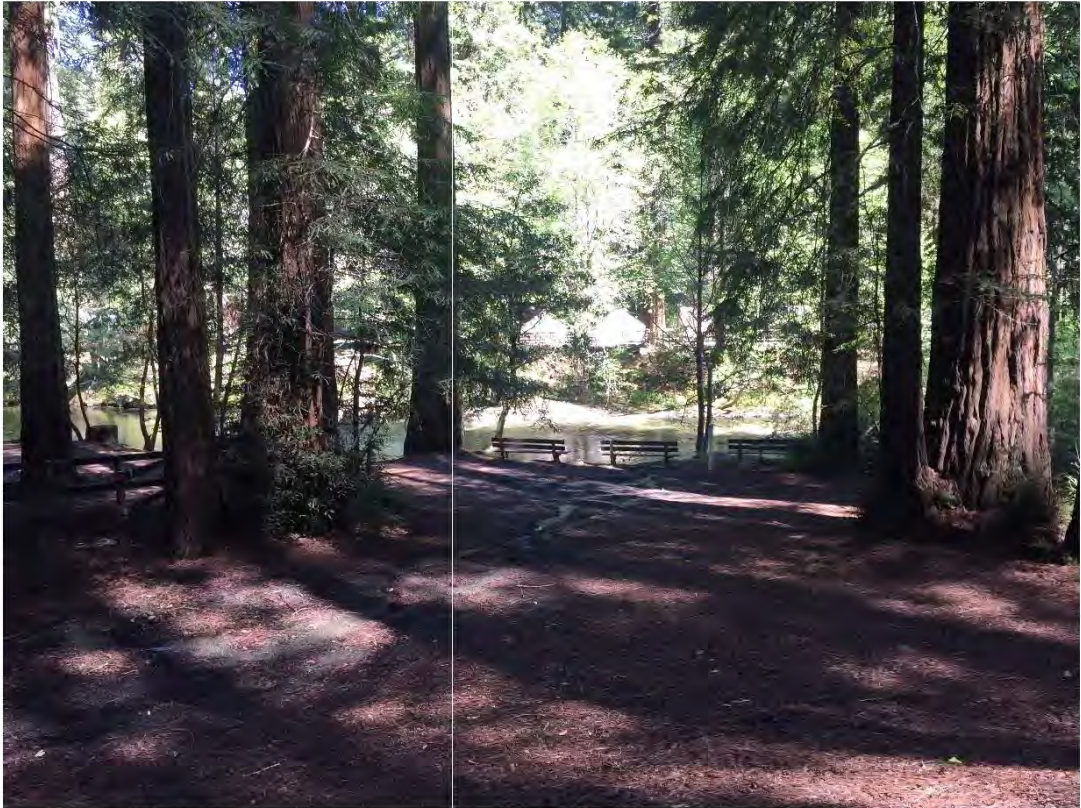
Before March 2019 flood event.