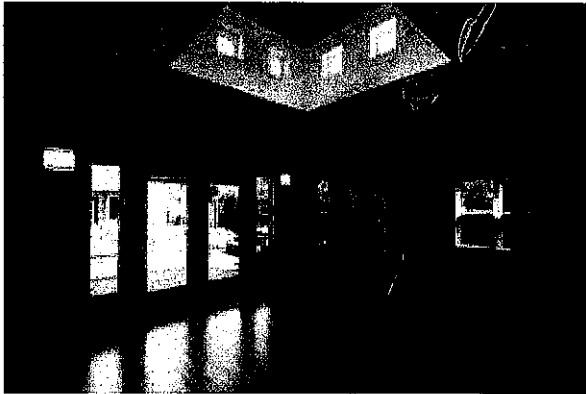
Courtyard and Community House