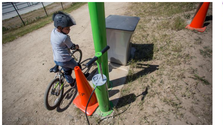
Bike Repair Station