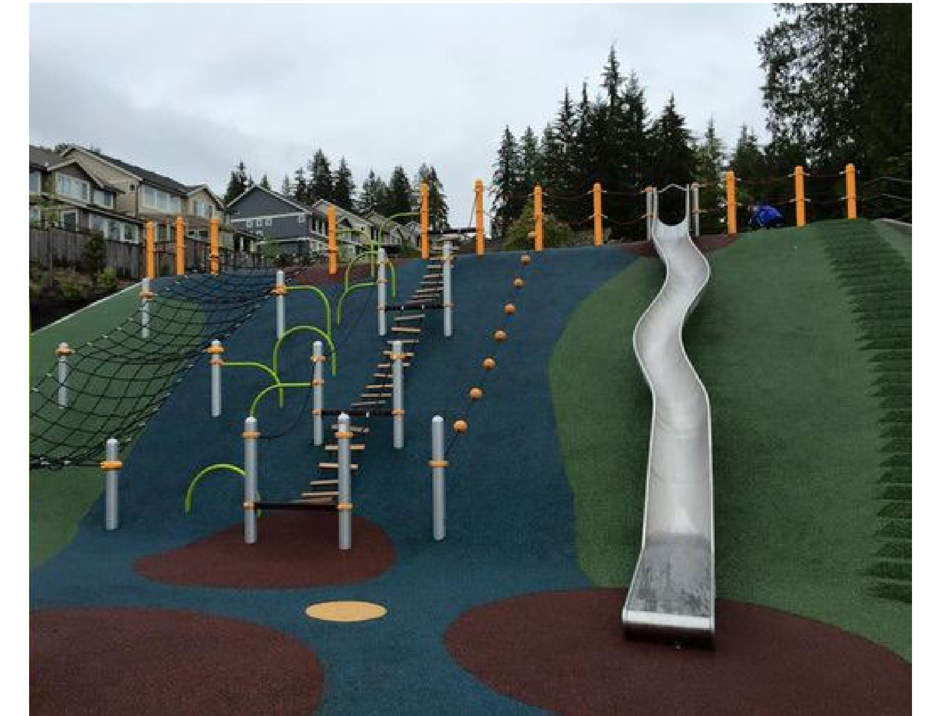
OPTION 3-RESILIENT RUBBER SURFACING WITH OBSTACLE EQUIPMENT