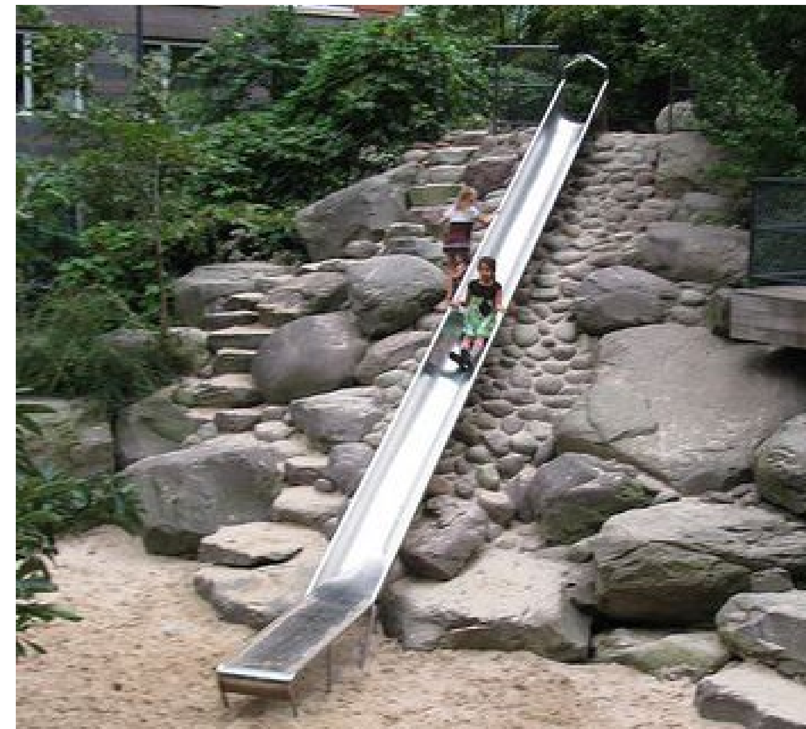
OPTION 2- BOULDER SCRAMBLE WITH STONE STEPS