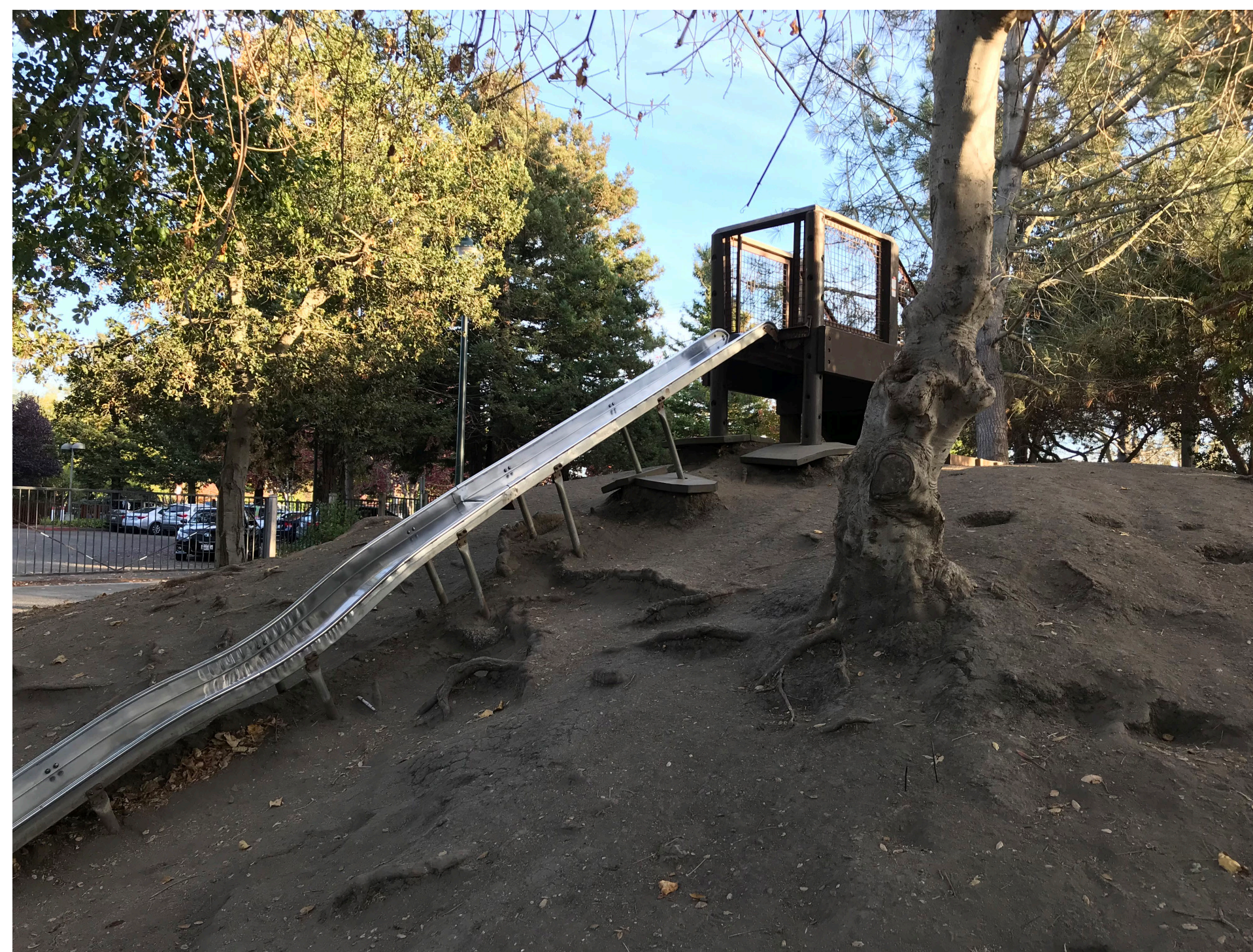
OPTION 1- EXISTING SLIDE