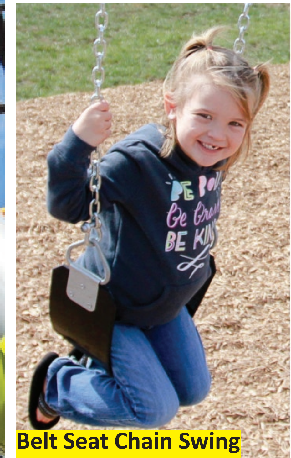
Belt Seat Chain Swing