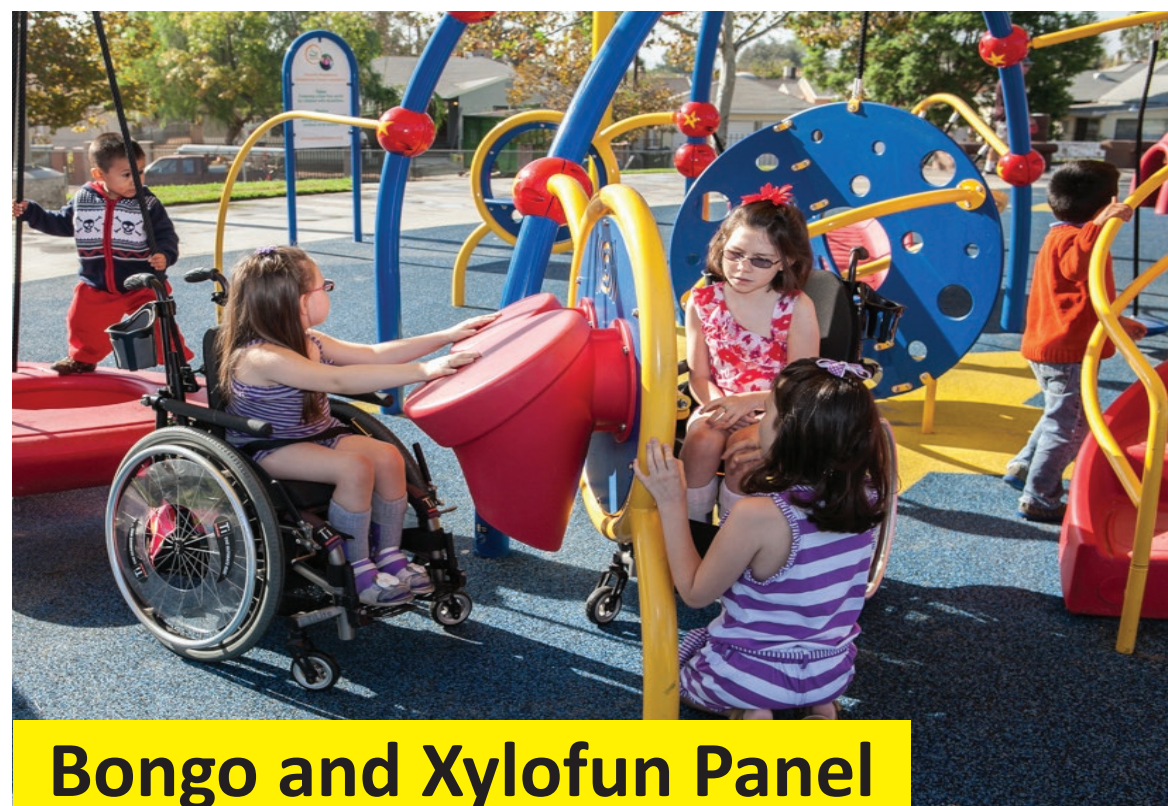
Bongo and Xylofun Panel