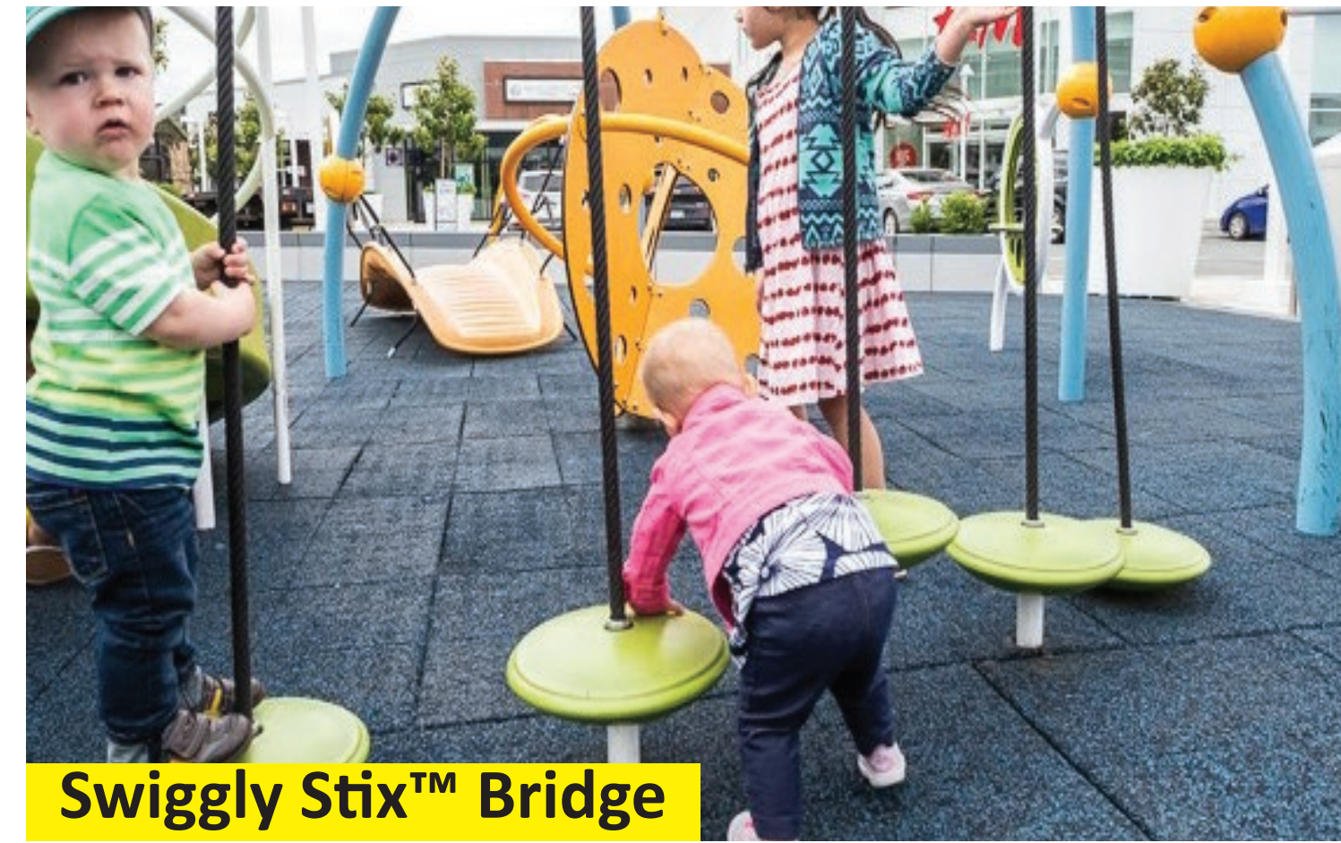
Swiggly Stix™ Bridge