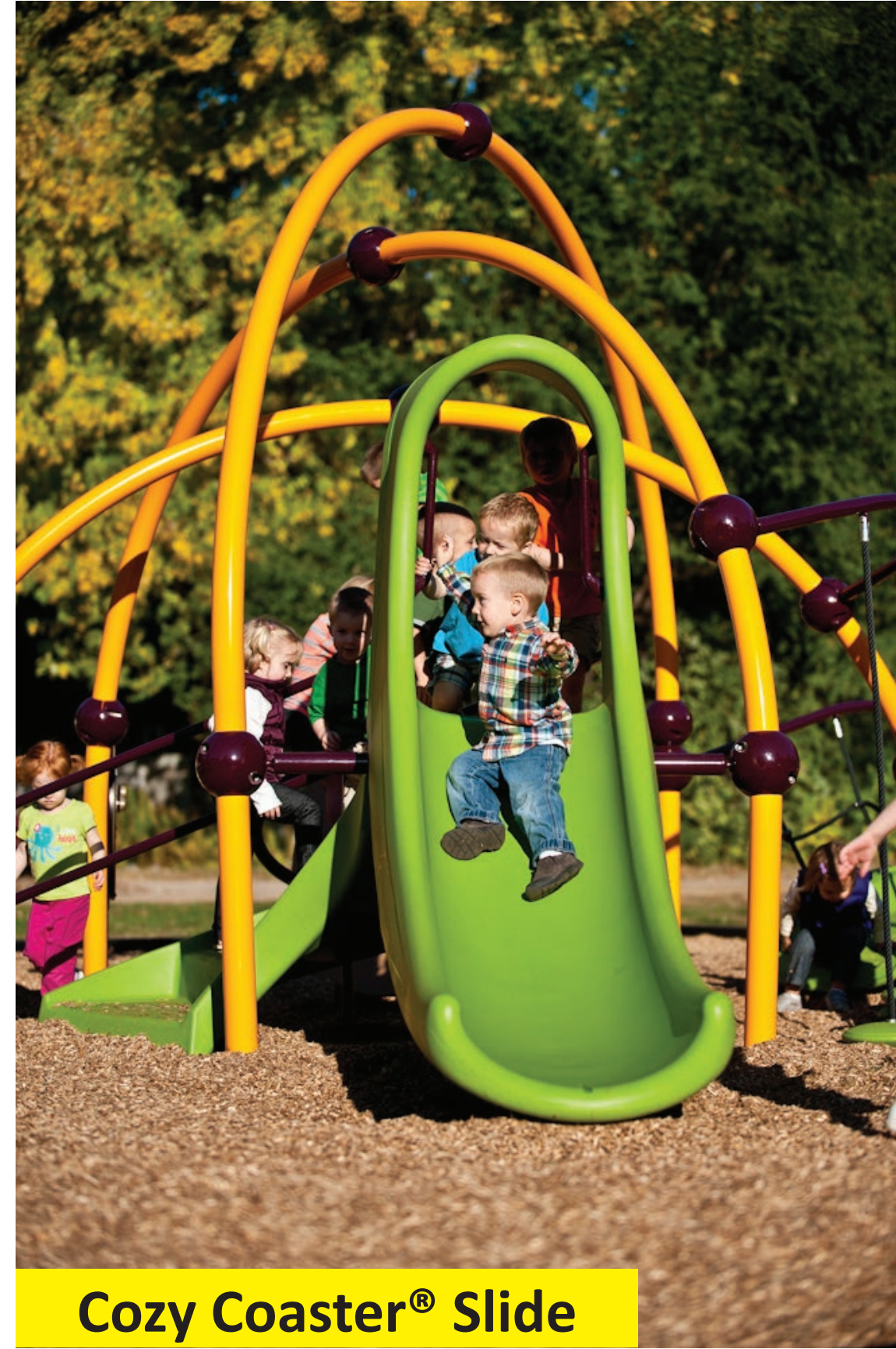
Cozy Coaster® Slide