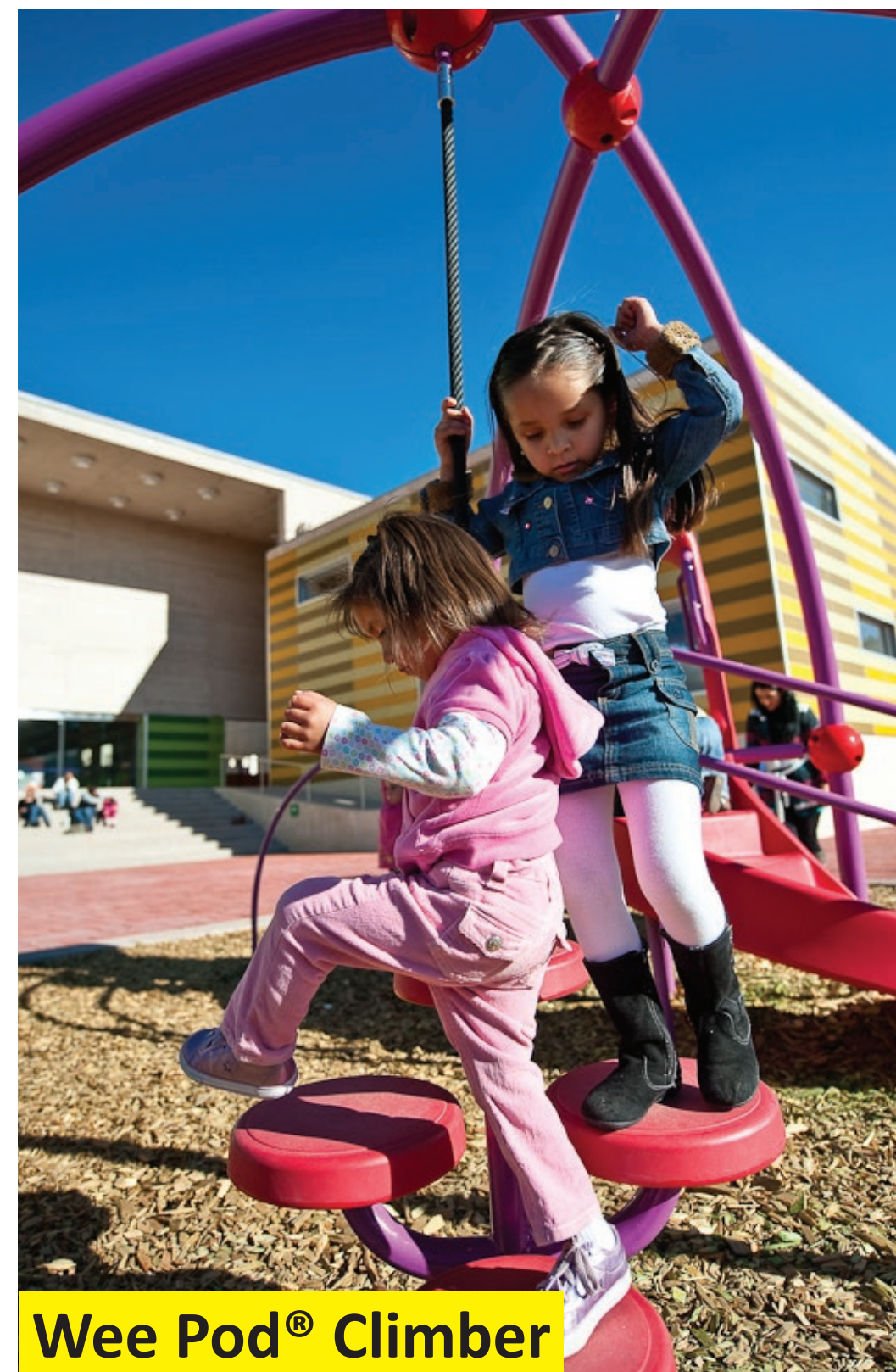
Wee Pod® Climber