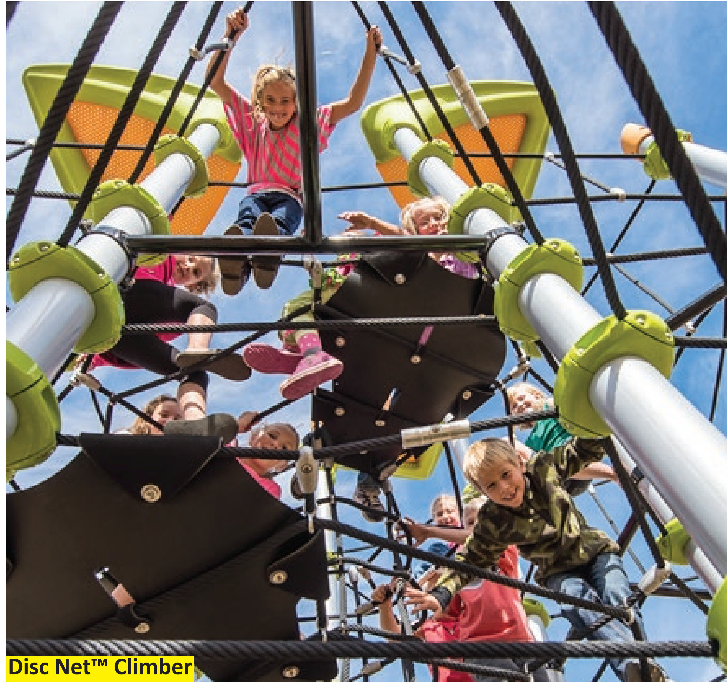
Disc Net™ Climber