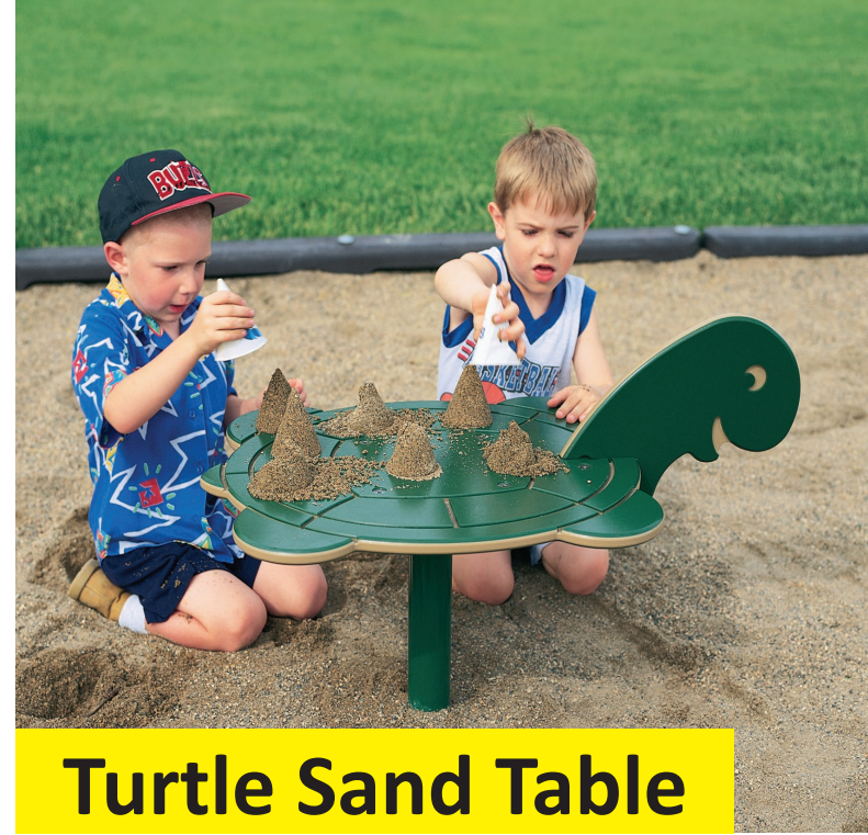
Turtle Sand Table