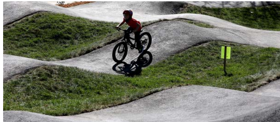
Paved Pump Track