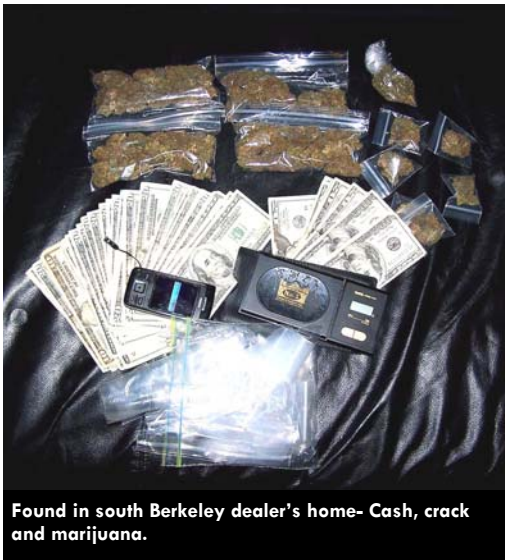
Found in south Berkeley dealer's home- Cash, crack and marijuana.