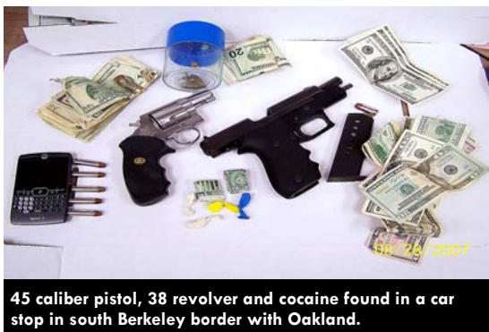
45 caliber pistol, 38 revolver and cocaine found in a car stop in south Berkeley border with Oakland.