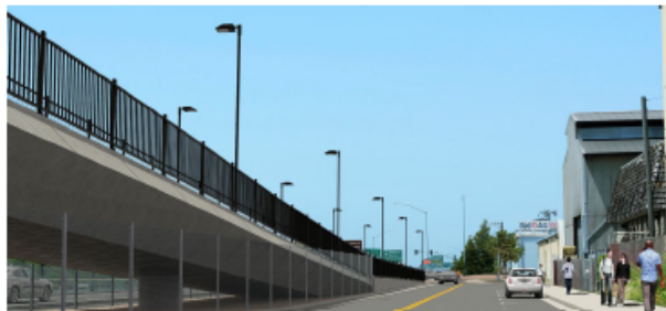
Conceptual rendering of the I-80 Gilman Interchange Improvements project looking north along Eastshore Highway before Gilman Street.