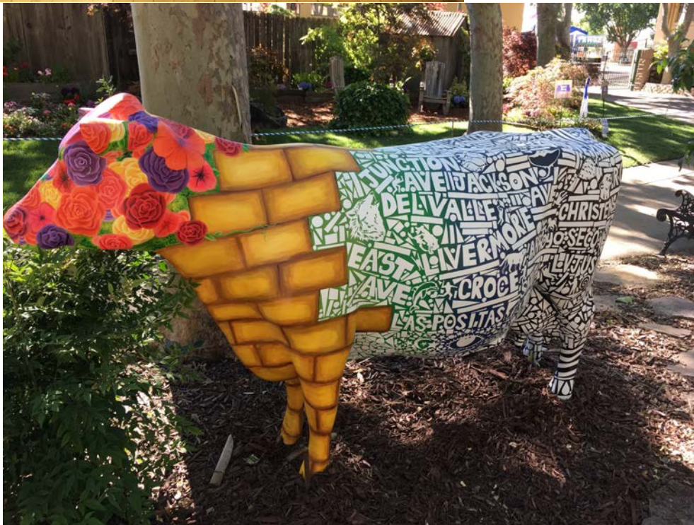
Chrysanthemum on display at the 2017 Fair.