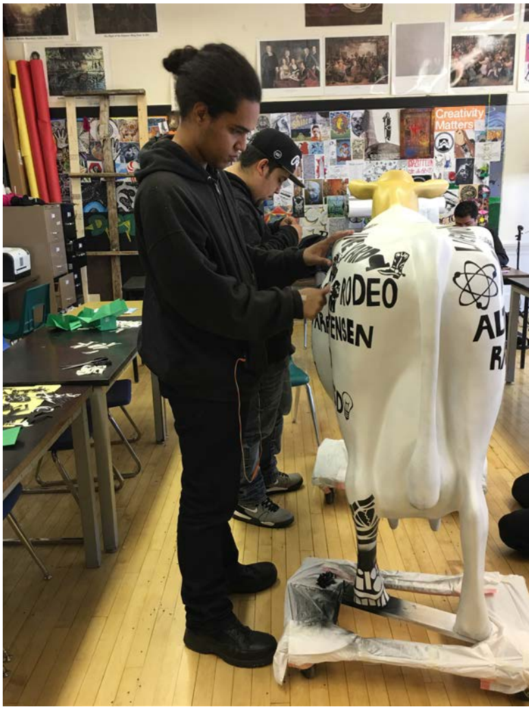
Del Valle High School students working on "Chrysanthemum," Livermore's hometown cow.