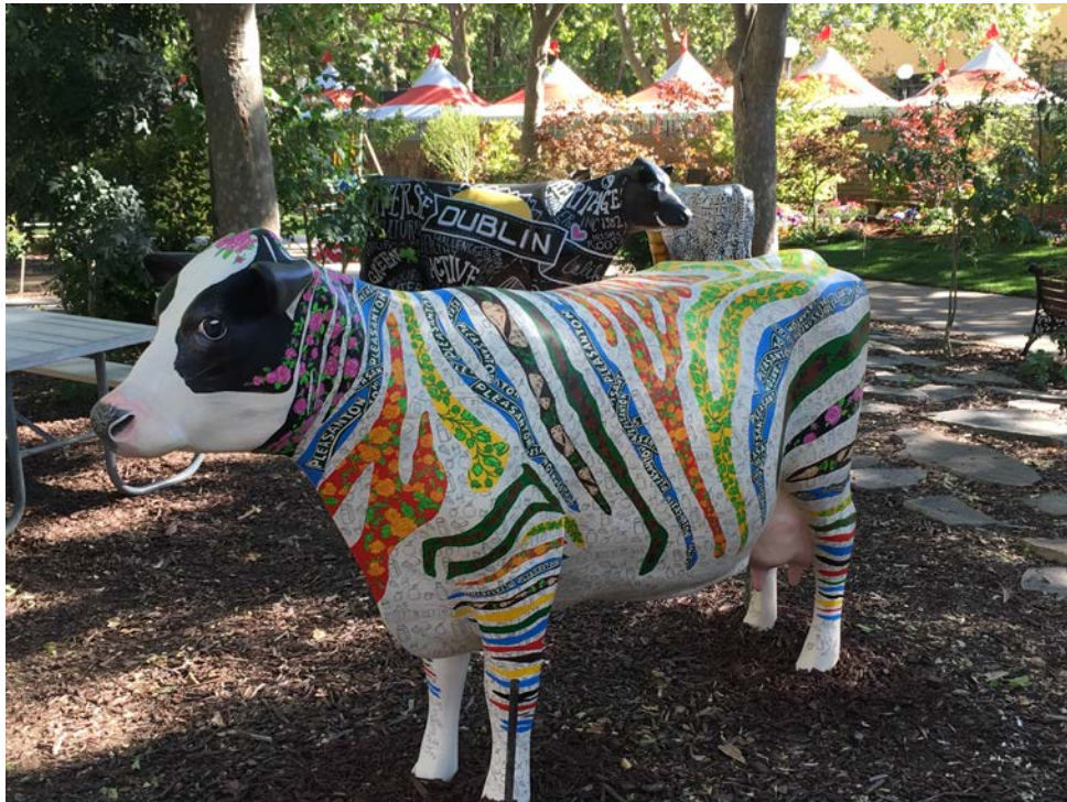
Pleasanton's "Penny Pleasanton" and Dublin's "US Dublin Prime" on display at the Fair.