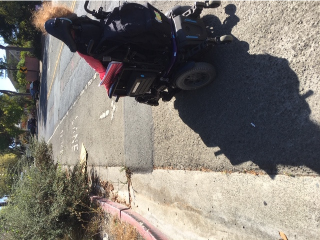
Photo 1: Rose and Henry side uneven tree roots causing cracks and uneven pavement making it unsafe for wheelchair users.

Photo 2: 2 blocks away from Rose and Henry around apt 137 uneven side walk by tree. Side walk goes up then angles down very unsafe for wheelchair uses.