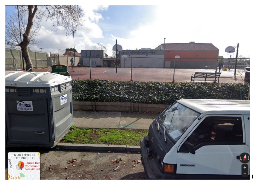
General Area of Mural