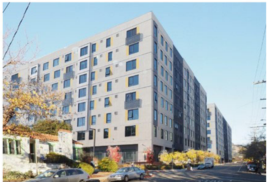
Simulation of 800-1200 unit project, along Delaware St, facing east

Sincerely, Emily Klion 1631 Francisco Street Berkeley