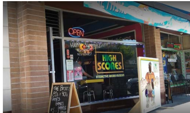
High Scores, Alameda CA