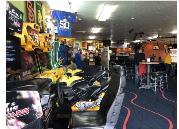
Albany Bowl, Albany CA