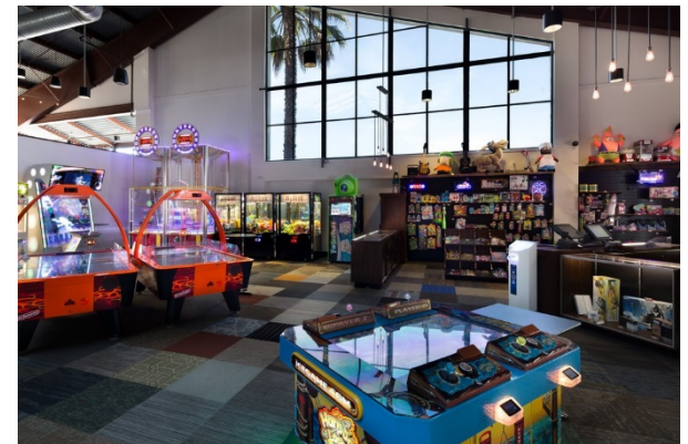
Plank, Oakland CA