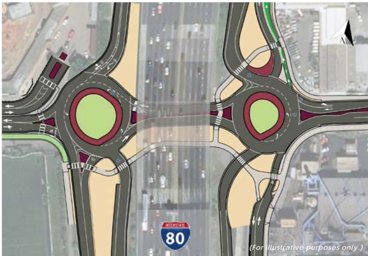
Overlay of the roundabouts at the project location.