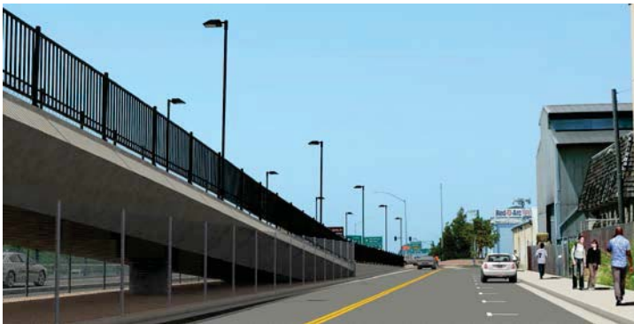
Conceptual rendering of the I-80 Gilman Interchange Improvements project looking north along Eastshore Highway before Gilman Street.