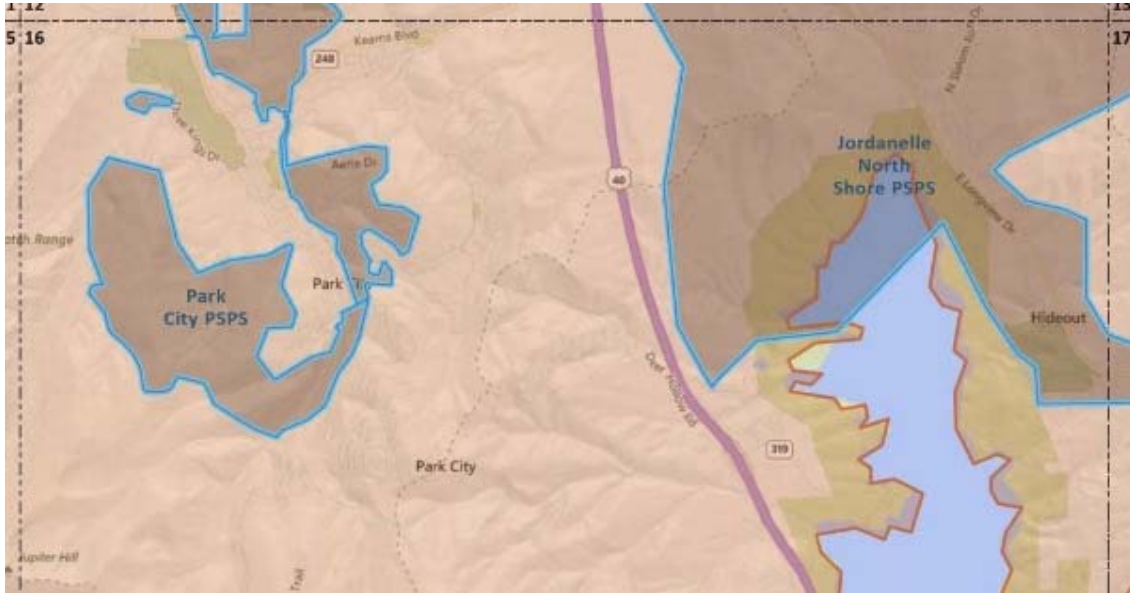
Map of critical areas for wildfire mitigation strategy implementation in Utah.