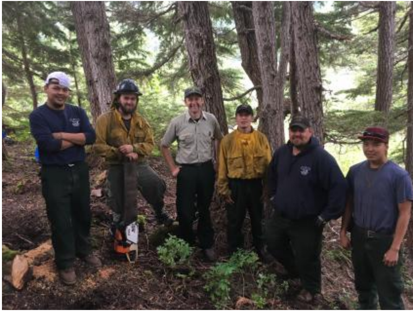
Chugachmiut members clearing a trail project on the Chugach National Forest.