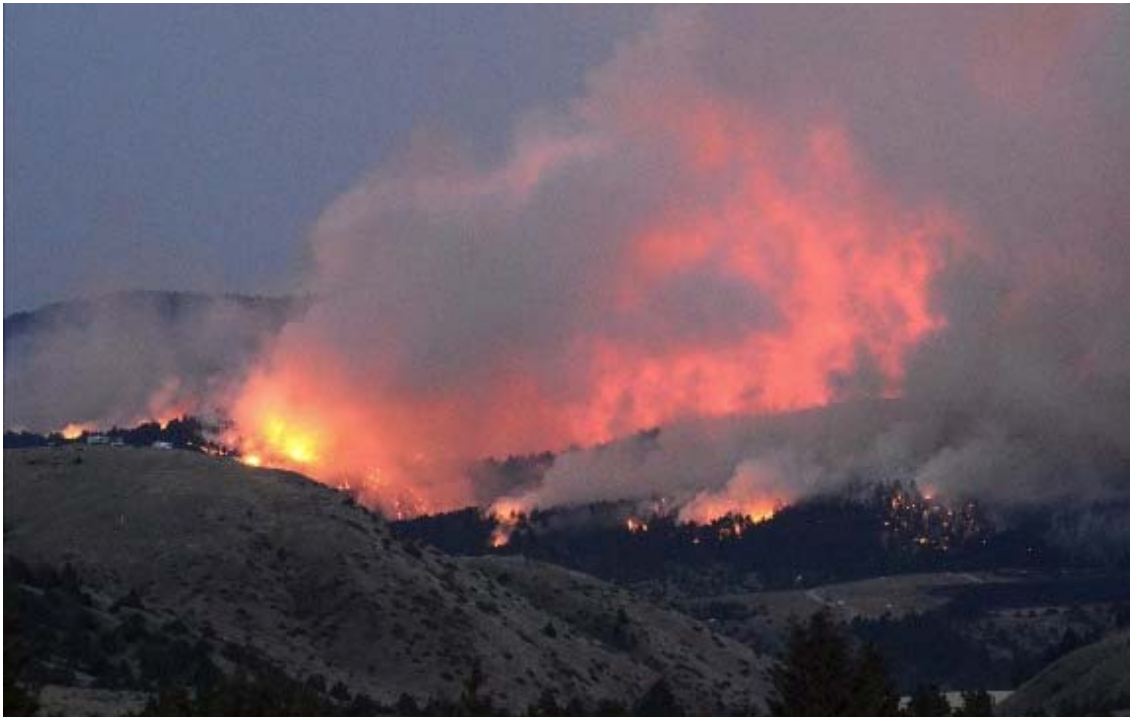
The Horseshoe Fire burns east of Clarkston, Montana.