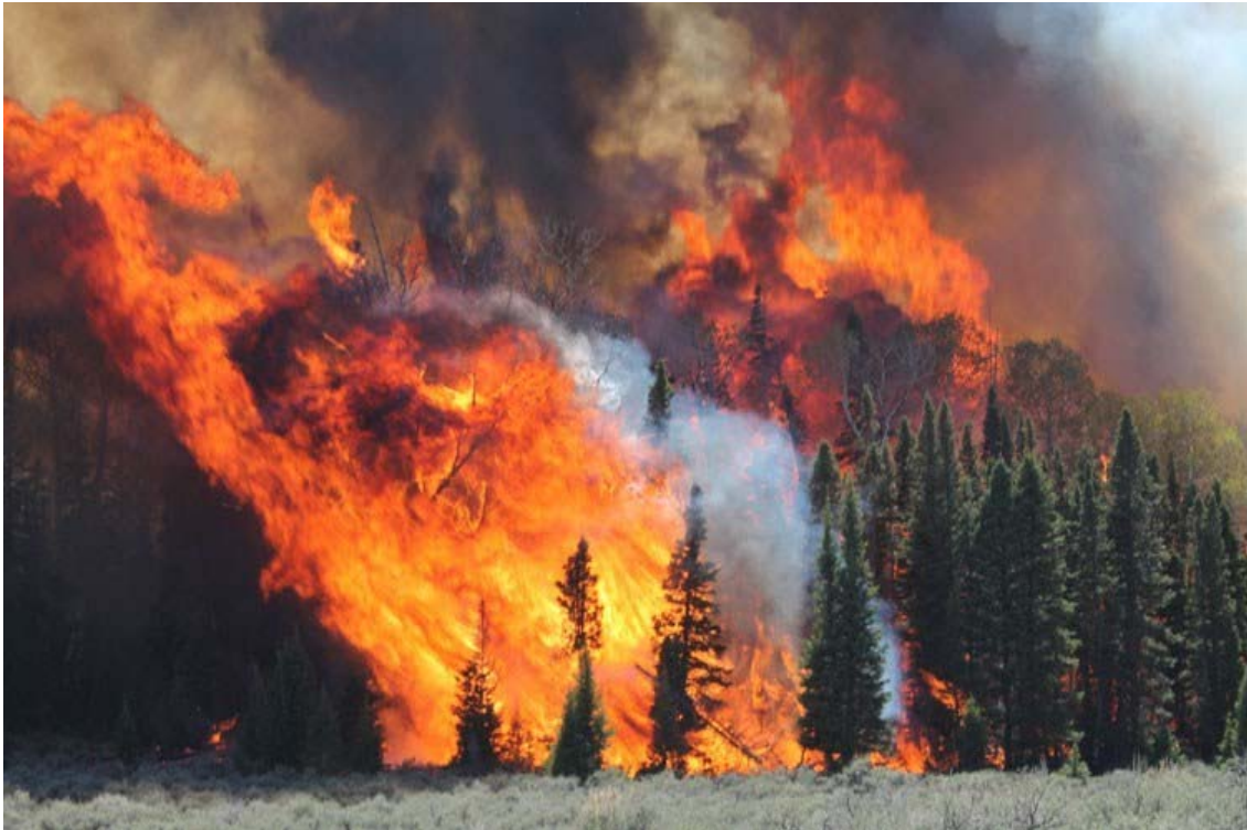
Manning Creek fire on June 20, 2019.