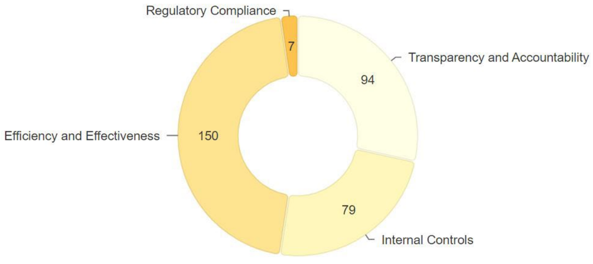
Figure 2. Recommendations by Type