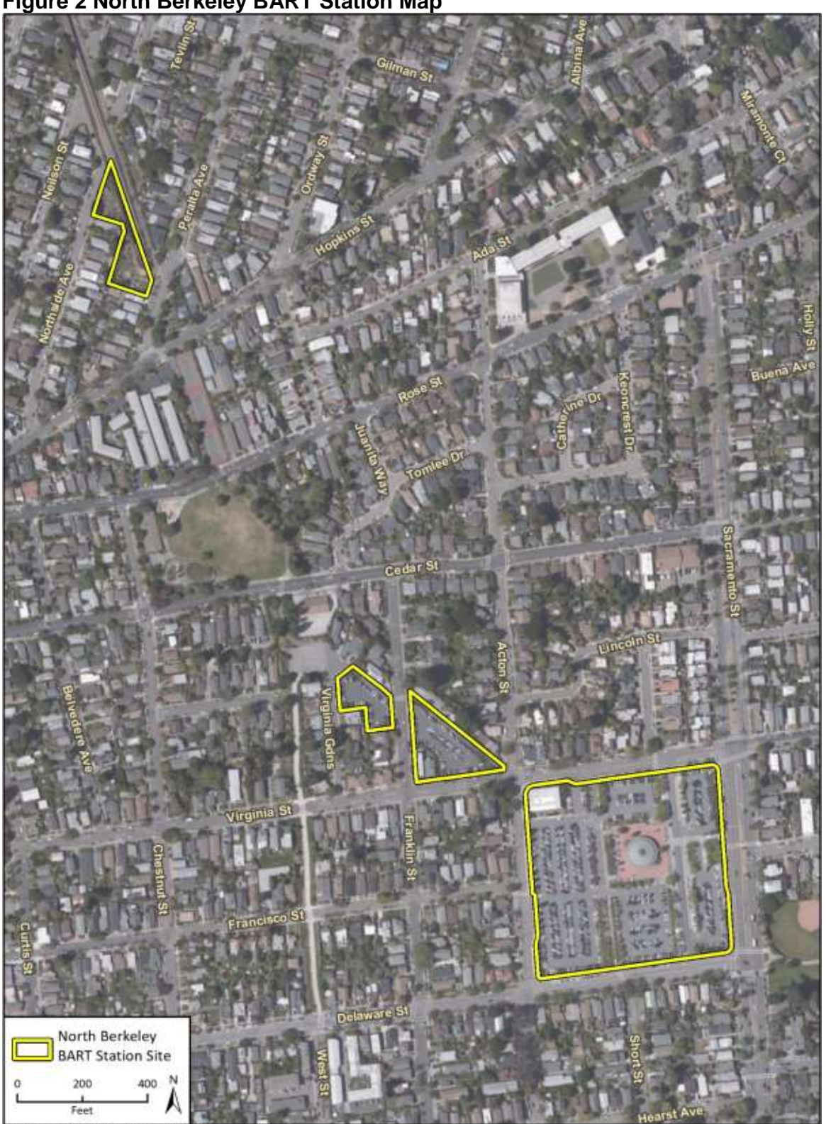
Figure 2 North Berkeley BART Station Map