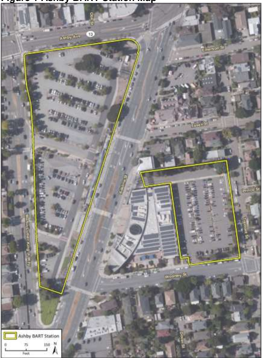
Figure 1 Ashby BART Station Map