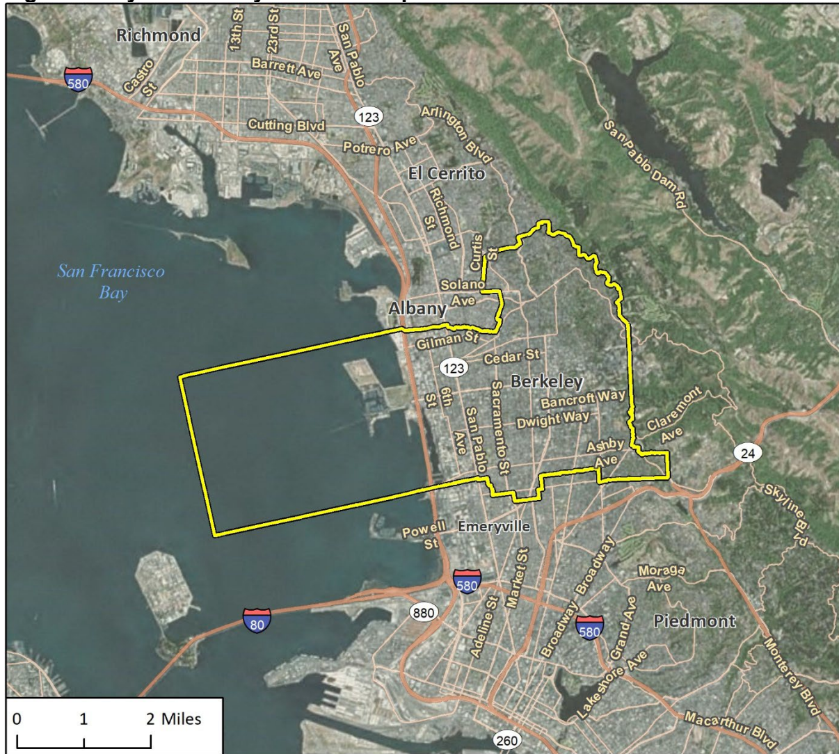
Figure 1 City of Berkeley Location Map