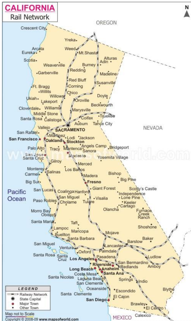
California Railway Map

Berkeley, Emeryville, and Oakland. From Oakland the trains would use the Coast Line via Hayward, Santa Clara, San José, Salinas and continue along the Pacific Coast into San Luis Obispo County. The same tracks are used by Amtrak for passenger transport.