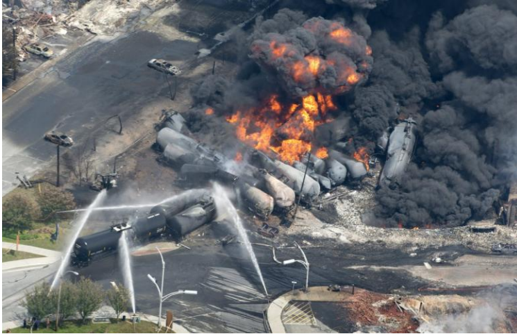
Rail cars burning after crude oil train derailment in Lac-Mégantic

A crude-by-rail project, the Phillips 66 Santa Maria Refinery rail spur extension project in San Luis Obispo County, 3 currently in the permitting stage, is planning rail transport of crude oil along water supply corridors for most of California and through densely populated urban and industrial areas, including through the East Bay. Trains delivering crude for this project would use Union Pacific rail tracks, which follow the Amtrak Capitol Corridor route through the Bay Area, shown below: