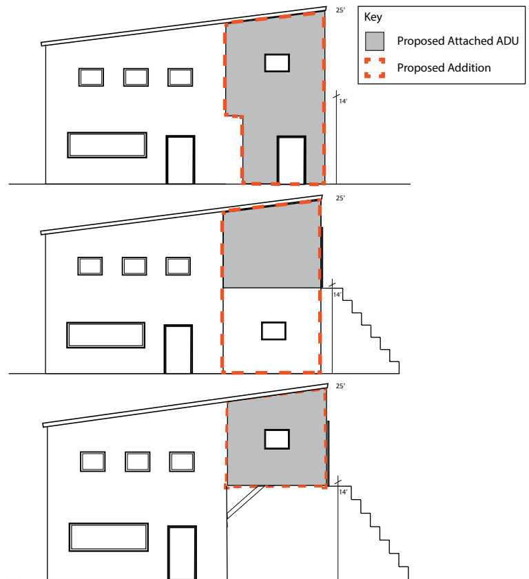
FIGURE 1 Permitted with a Zoning Certificate (ZC)

6. What kind of permit do I need to build an ADU as an addition to my house? An addition of up to 25 ft. is permitted with a Zoning Certificate (ZC). See Figure 1 to see configurations permitted with a ZC.