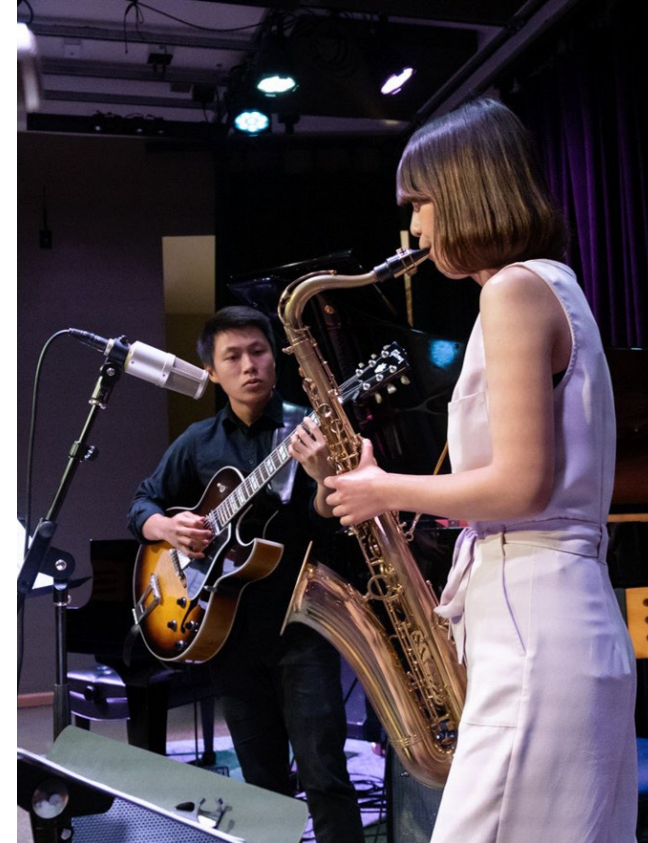
California Jazz Conservatory, FY22 Arts Organization Grantee