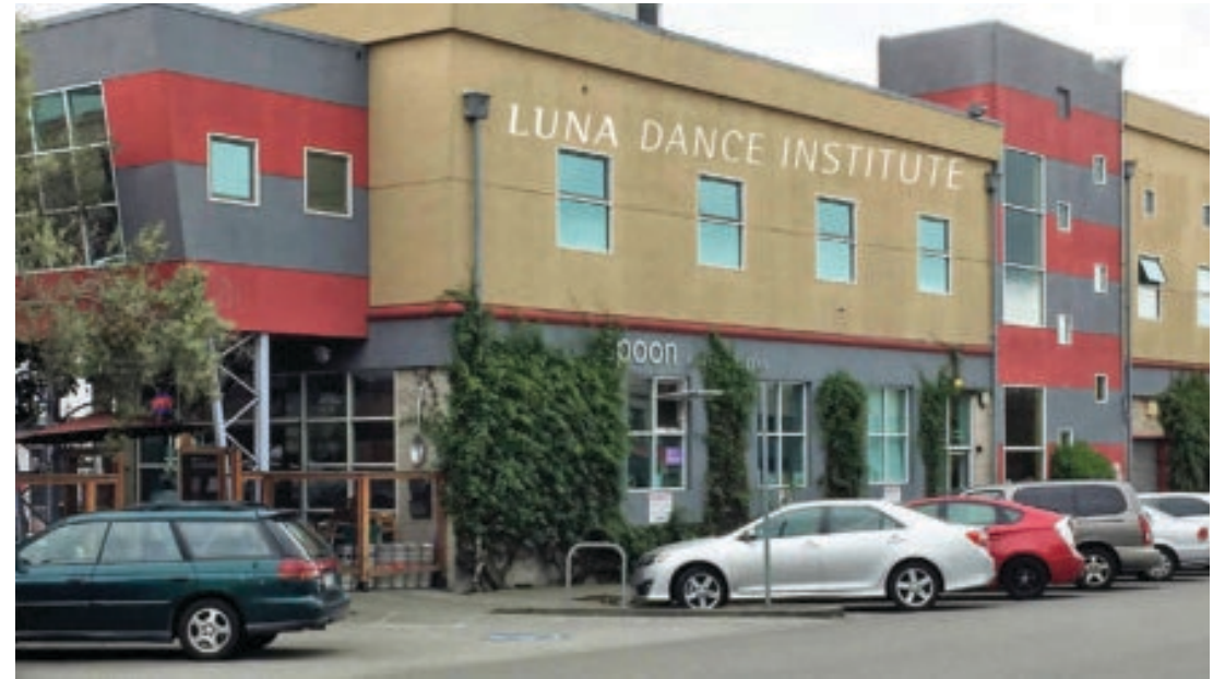
Luna Dance Center, new building supported in part by City of Berkeley

A project that helps maintain, improve, or adds to the organization's infrastructure. It results in an acquisition of a new asset or new construction, improvements, expansion, renovation, rehabilitation, repairs, or replacement of an existing facility and other infrastructure assets in the City of Berkeley.