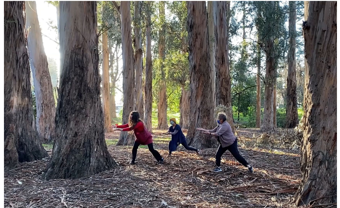
Chingchi Yu, Choreography and Performance, FY21 individual Artist Project Grantee