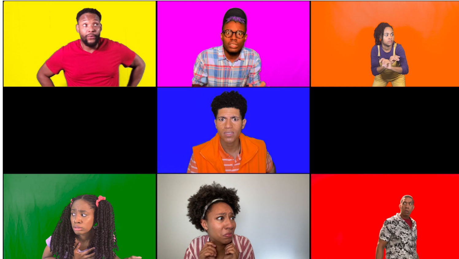
Bay Area Children's Theatre, FY22 Arts Organization Grantee