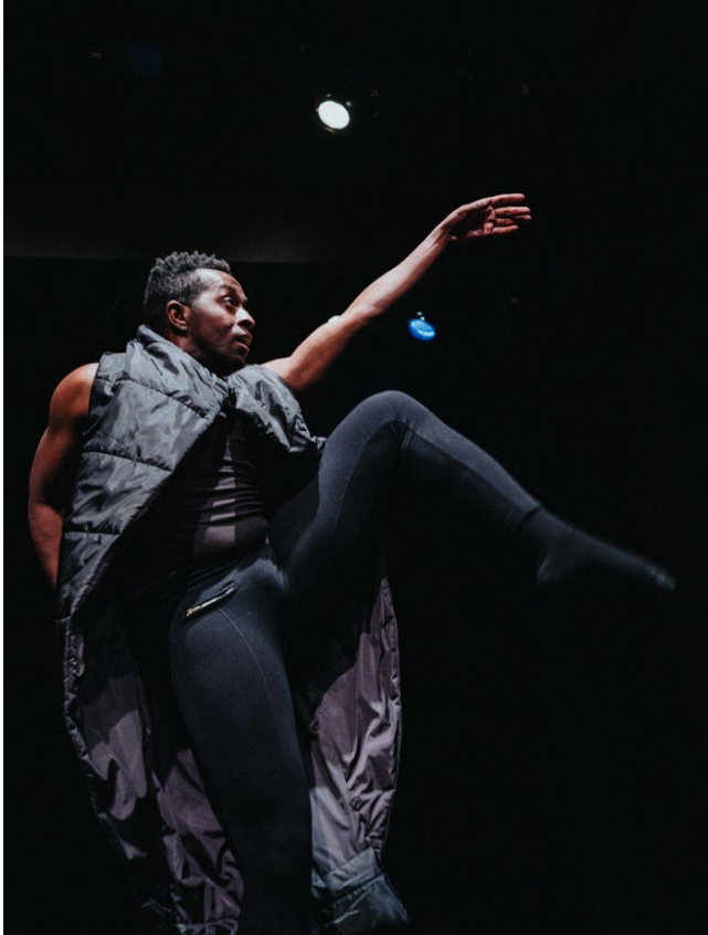
Queering Dance Festival, FY22 Festival Grantee

Funding for festivals and special events.