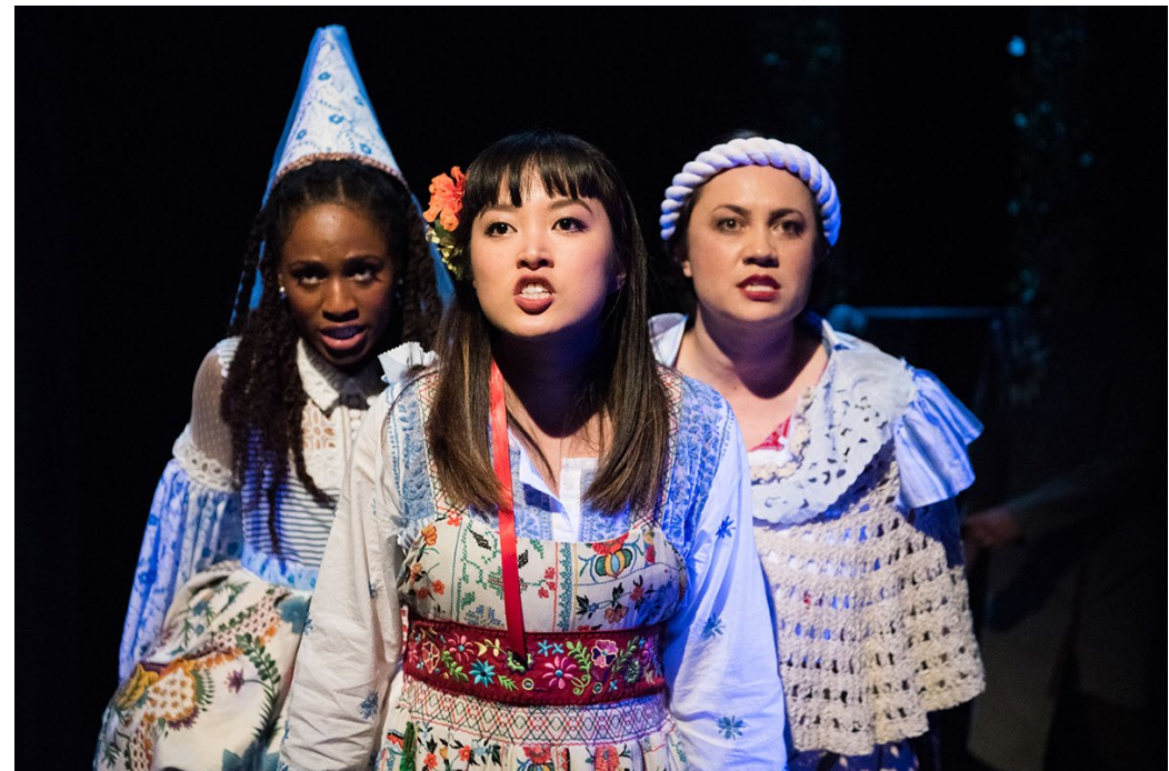
Shotgun Players, FY22 Arts Organization Grantee