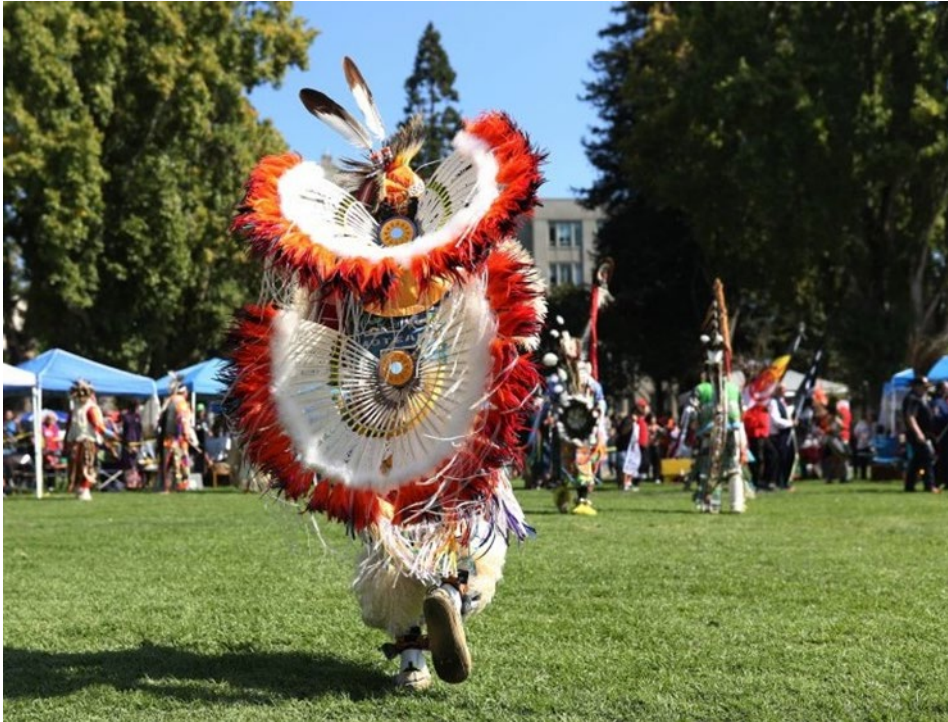
Annual Berkeley Indigenous Peoples Day Powwow & Indian Market, FY22 Festival Grantee

Cultural Equity Statement: The City of Berkeley Civic Arts program commits to equity within the arts and culture sector by consistently evaluating its programs and practices. The City recognizes the multiple benefits the arts provide, regardless of race, color, religion, age, disability, national origin, sex, sexual orientation and gender identity/expression.