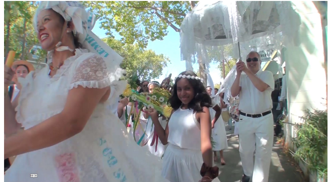
SF Bay Brazilian Day & Lavagem Festival, FY21 Festival Grantee