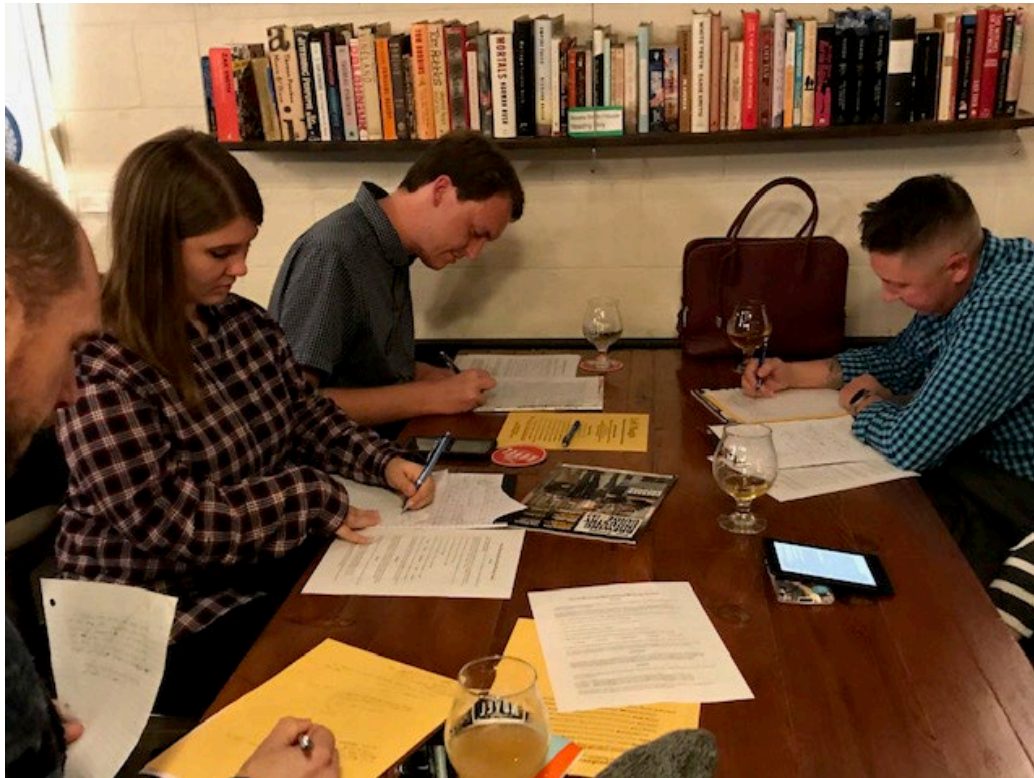
Left Margin LIT, FY22 Arts Organization Grantee