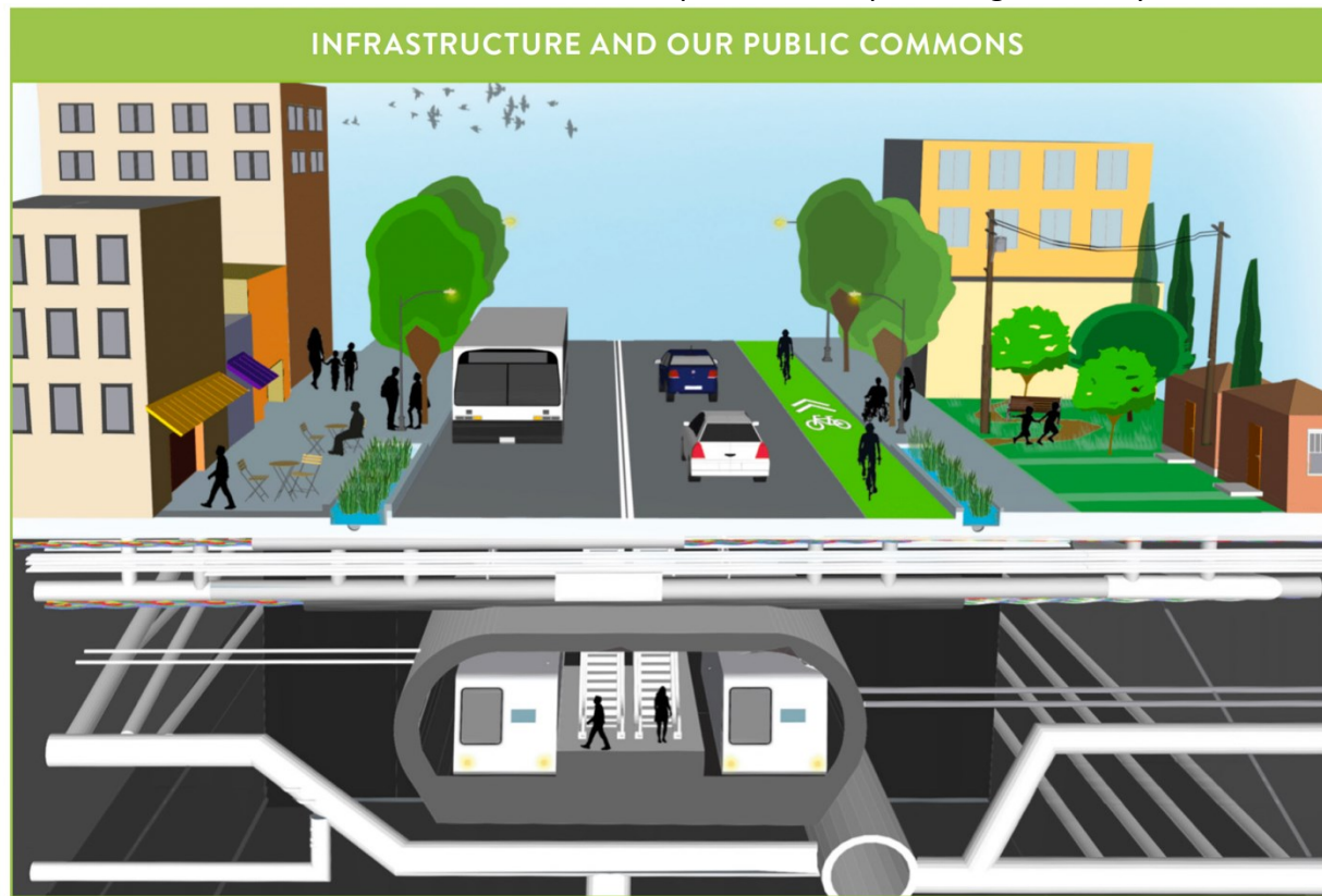
FIGURE 1. Illustration of common pieces of the public Right-of-Way

The pROW is essential for our lives. Without the pROW there would be