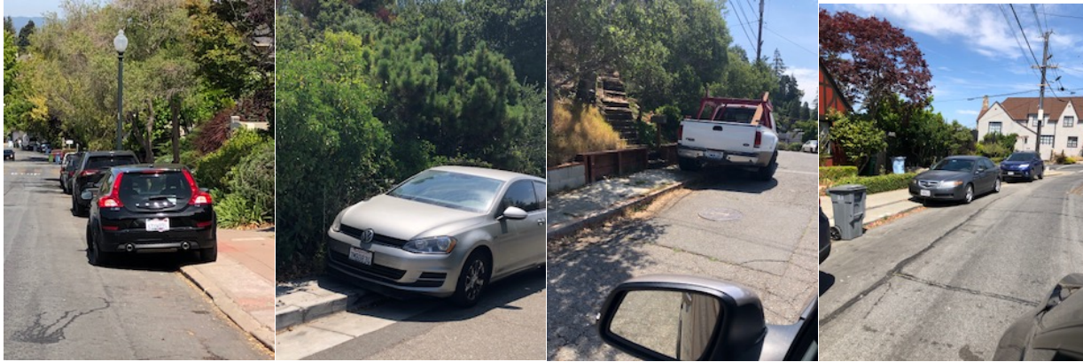
Los Angeles St