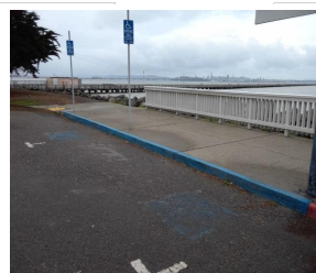
Exhibit C - Improvements